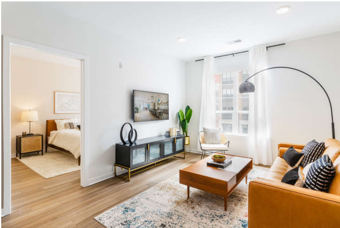
All images of One Ten

As leasing launches at One Ten in Jersey City, this represents a milestone not just for the six-story building, but for the partnership between BNE Real Estate Group, McKinney Properties, and Hoboken Brownstone Company: One Ten is the third building in their Enclave series, a collection of three buildings that includes One Hundred House and The Enclave . Prices at One Ten start at $1,695/month with grand opening incentives that include up to four months free rent .